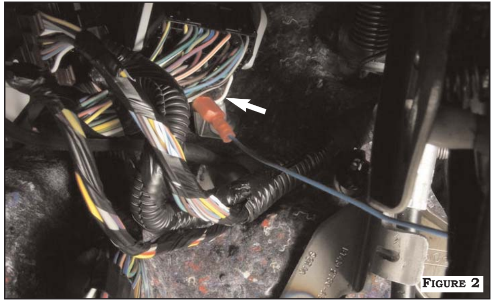
FORM #5269, REV. RTP, 01-13-11

CONNECT BLUE WIRE TO EXTENSION HARNESS PROVIDED IN SACK PART OF KIT. ROUTE EXTENSION HARNESS TO PASS THOUGH CONNECTOR LOCATED AT DRIVER SIDE FIREWALL IN LEFT CORNER. CONNECT TO WHITE WIRE OF PASS THROUGH CONNEC-TOR FOR IGNITION POWER.