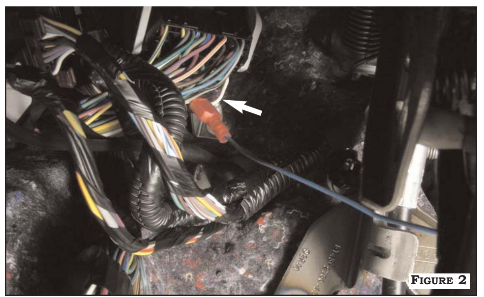
FORM #5269, REV. RTP, 01-13-11

CONNECT BLUE WIRE TO EXTENSION HARNESS PROVIDED IN SACK PART OF KIT. ROUTE EXTENSION HARNESS TO PASS THOUGH CONNECTOR LOCATED AT DRIVER SIDE FIREWALL IN LEFT CORNER. CONNECT TO WHITE WIRE OF PASS THROUGH CONNEC-TOR FOR IGNITION POWER.