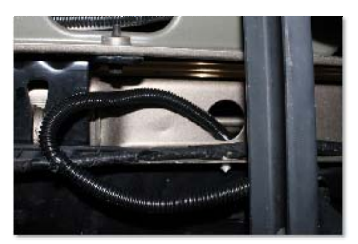
Figure 3 Figure 4